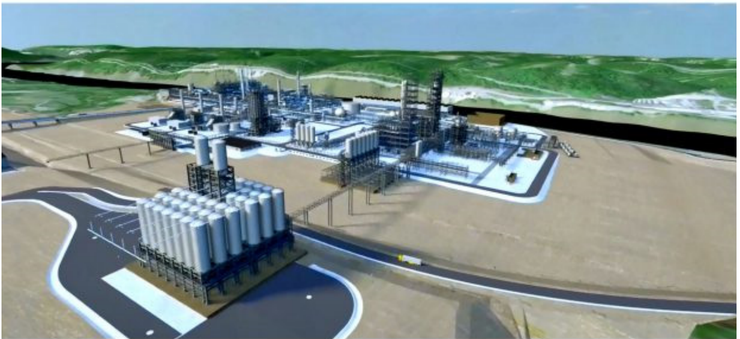
An artist's rendering of the cracker plant courtesy of Shell.