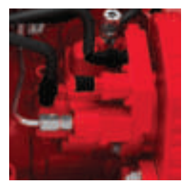
High Pressure Common Rail (HPCR) Fuel System From Cummins Fuel Systems

The patented design is widely recognized as the industry leader for performance. Electric actuation improves precision and responsiveness. The VGT Turbocharger also increases fuel economy and braking horsepower.